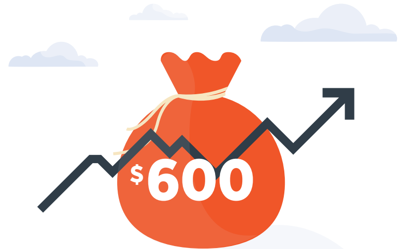
ESTIMATED YEARLY SAVINGS (FOR A $500 AVERAGE MONTHLY BILL)

Exact savings depend on your local Community Solar program, but most businesses can expect to save about 10% on their electricity by joining Community Solar. That amounts to hundreds or thousands in savings each year--money you can put toward fulfilling your own mission.